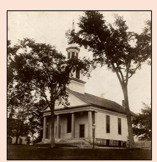
Boylston Church -Third Meeting House This steeple blew off roof in 1903 storm

This seasonal social event that drew hundreds of people wishing to enjoy a bountiful dinner the evening of January 18, 1906 may have ended the tradition painfully when on January 19, a headline read: "Collapse of Church Floor Injures Many. Fifty or more persons dropped into the