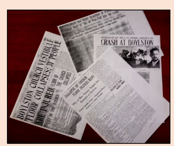
Newspaper Clippings Stop by Museum to read News Articles BHSM Newspaper Collection

Fortunately, only 31 people were listed as injured, ten seriously, others less seriously. Men acted as heroes making sure every woman was taken out before the men who waited patiently for their extrication. "When the flooring collapsed, the carpet remained intact and served as a slide and also